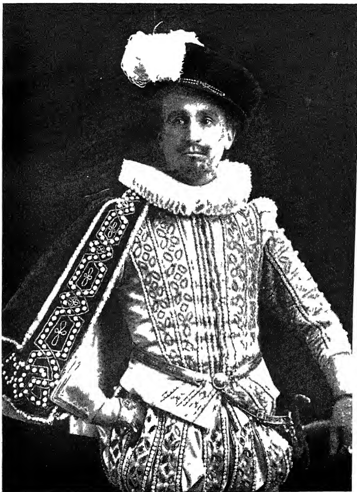
THE AUTHOR AS THE EARL OF ESSEX